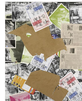
Josh Smith Untitled , 2006

Yi Chen , Moisturized Odessa , 2006 Oil on canvas. 44" x 42"