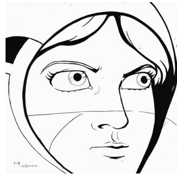
Yoshitaka Amano Untitled (Superhero), 2004